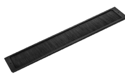
370*70mm Brush Cable Entry SWA-BBST-01-CBK