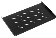
275mm Deep Fixed Shelf SUA-FSST-01-45-CBK