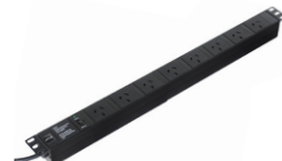
8-Way Horizontal Power Rail DPU-EHA-1U-080210-06-CSI