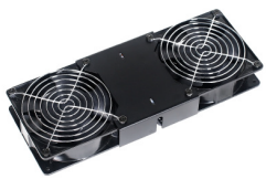
2-Way Roof Mount Fan Kit SCA-UCST-03-CBK